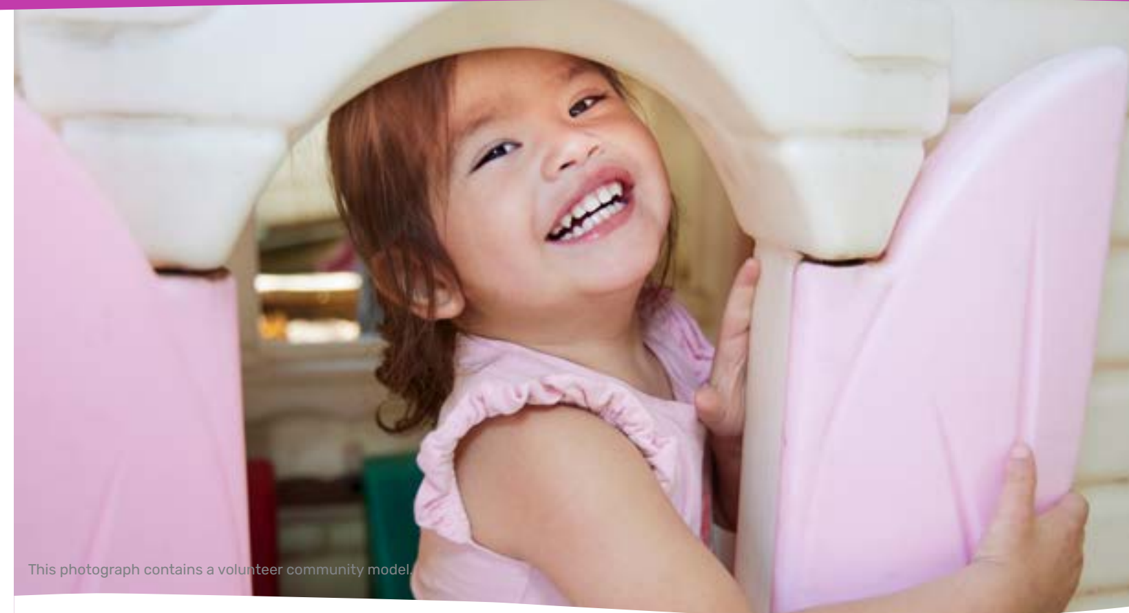
This photograph contains a volunteer community model.