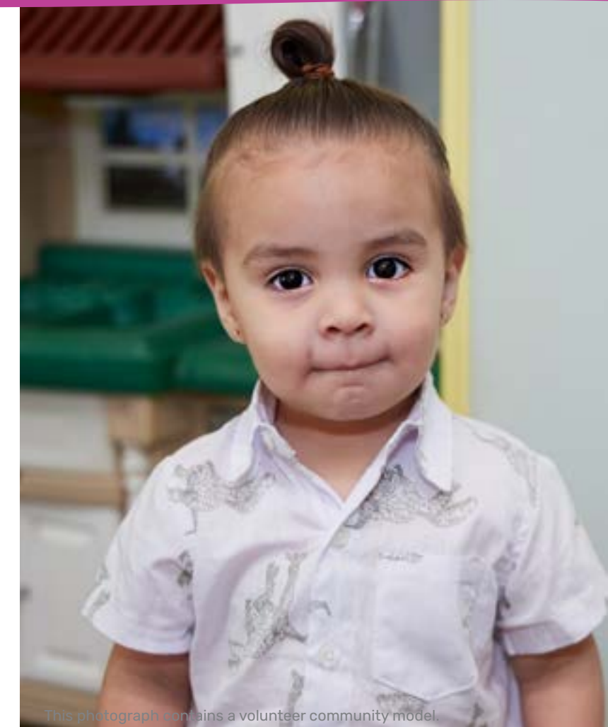
This photograph contains a volunteer community model.