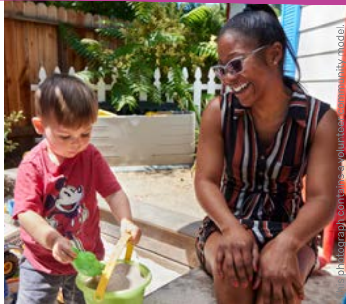
the photograph contains a volunteer community model.