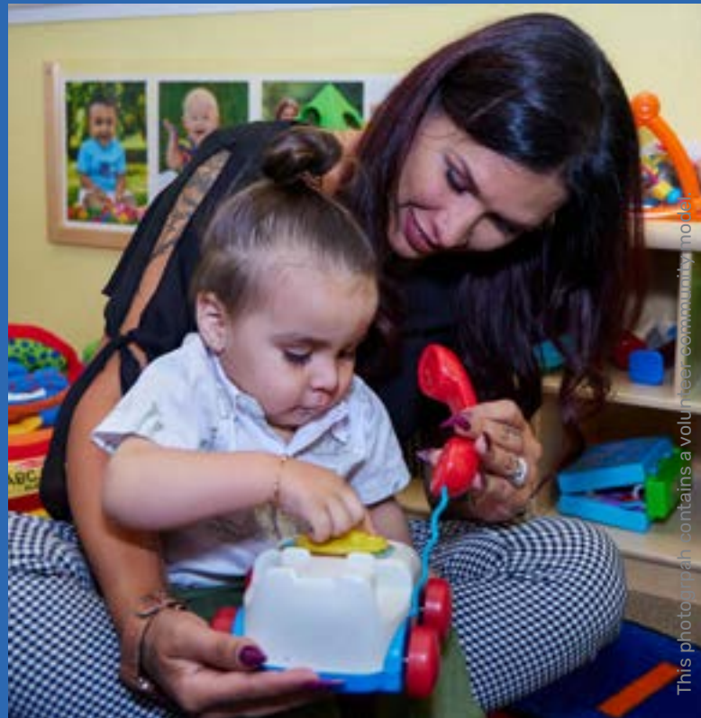
This photograph contains a yolo crisis nursery logo.

Safety. Commitment. Compassion. Respect. Community. Hope.